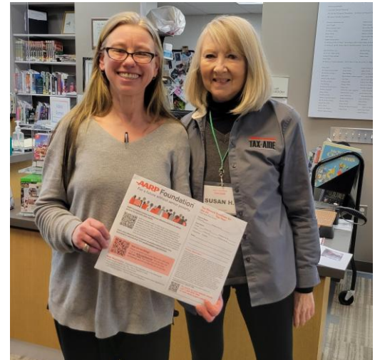
AARP Tax prep was a big success