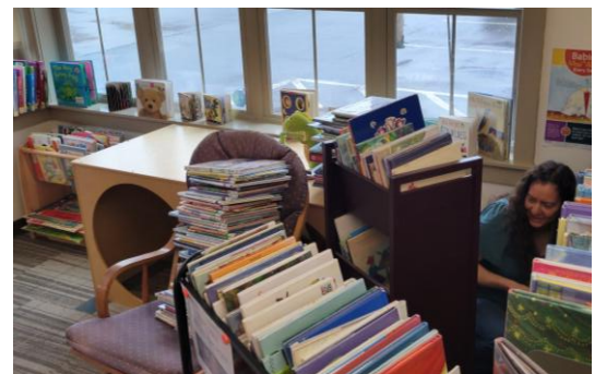
Principal Clerk, buried in books, finishing up the re-categorization project