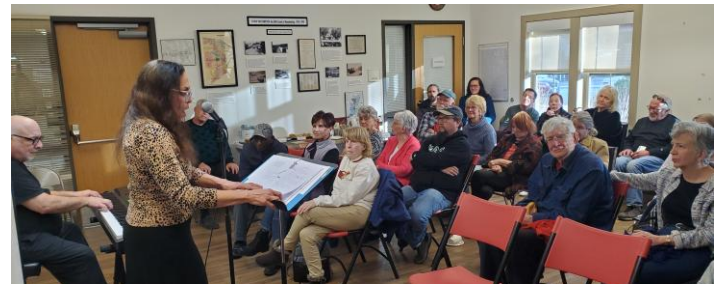
Bossa Nova Concert for Women's History Month